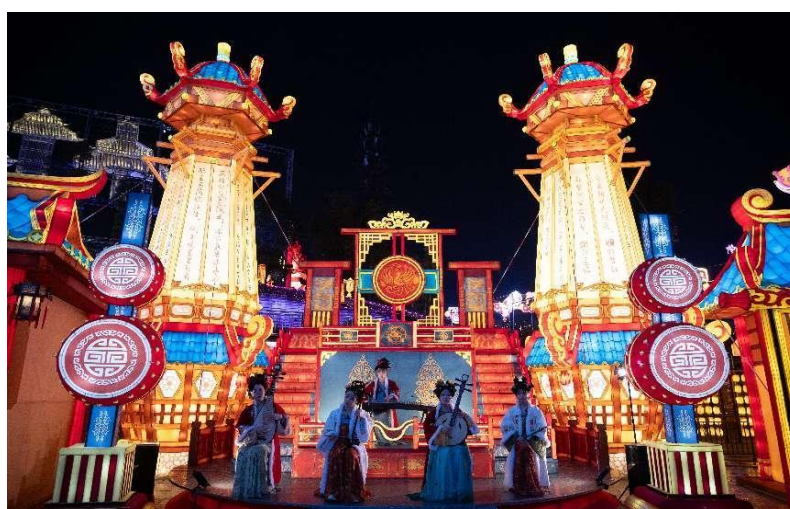
Figure 9: Zigong Lantern Festival

Gongs and drums to celebrate the New Year: During the Spring Festival in the old days, Zigong not only performed dramas, but also played "gongs and drums to celebrate the New Year", which gradually became a custom of the Spring Festival in Zigong at that time. From the end of the Qing Dynasty to the founding of the People's Republic of China, fans of Ziyang river opera in Zigong like to play "lunar New Year gongs and drums". Ziliujing in Zigong City is the most representative. From the first to the fifteenth day of the first lunar month of the Spring Festival, every household lights up lights and colors. , waves of New Year gongs and drums compete in competition, the sound is heard in all directions, and it is very lively. Zigong's Naannian gongs and drums include Sichuan Opera gongs and drums, which is conducive to the inheritance and development of Ziyang River Sichuan Opera percussion music.