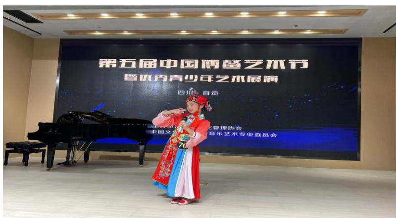
Figure 5 Sichuan opera into the campus

In 2024, 12 undergraduate colleges and universities in China will be recruiting opera major candidates, including director, composition, music, and performance majors. However, there are no domestic undergraduate colleges offering related majors, and Sichuan Arts Vocational College is the only higher education institution offering a Sichuan opera major. Most relevant personnel have a college or technical secondary school degree, and 67 people have a college degree or below. In 2021, 32 students were selected to form a "Zigong Commissioned Training Class" and entrusted to Sichuan Vocational Art College to conduct directional training. However, four students were unable to persist in their studies and applied to drop out of school. China implements a nine-year compulsory education program with 164 million students in 2023. Traditional arts courses should be integrated into learning in various forms, and Ziyang River Sichuan Opera should be combined with campus art to achieve a virtuous cycle of inheritance and development.