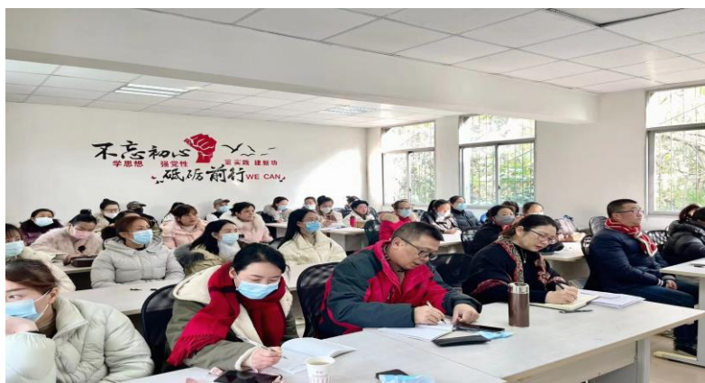
Figure 6 Native language culture and music education lectures

Ziyang River Sichuan Opera has been a significant cultural influence in Zigong for centuries, but there is limited literature on its inheritance and development. A survey conducted in December 2023 revealed that 62 people know about Sichuan opera, but none know "great river Sichuan opera." To promote and guide the opera, art education workers need to gather more information and visit the Zigong Sichuan Opera Art Center and interview old artists.