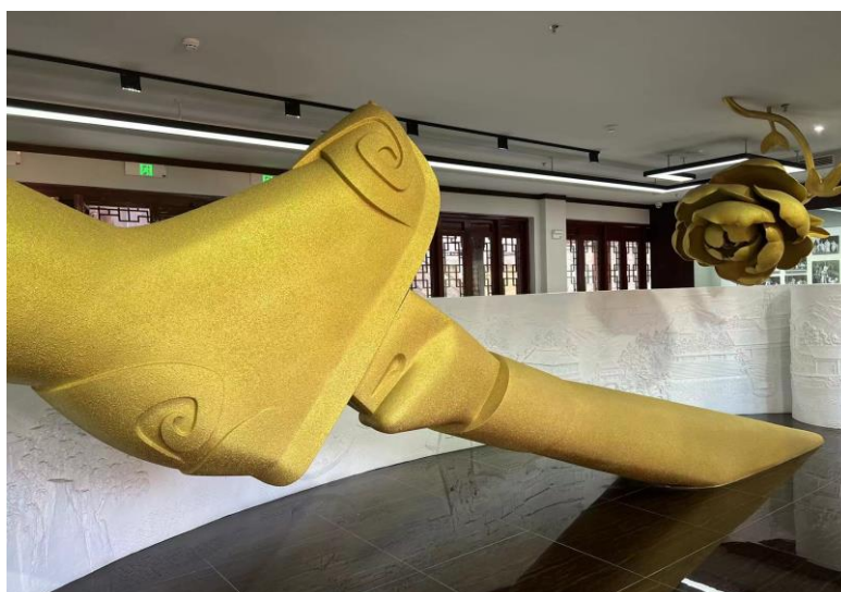
Figure 8 Fist and boots (good and evil)