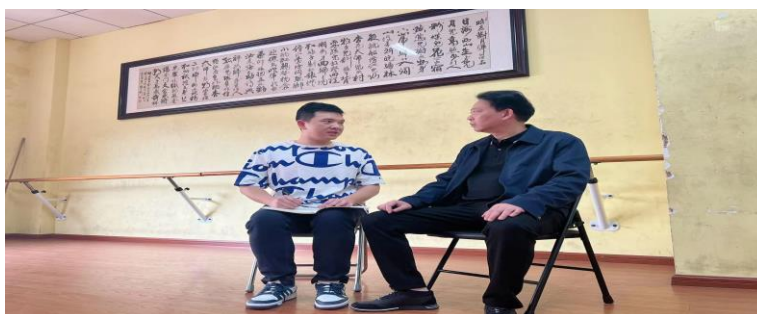
Figure 3 Liu Kaikui, national first-class actor, Inheritor of Ziyang River Sichuan Opera (first from right)