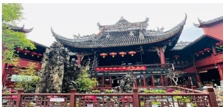
Figure 1 Wang Ye Temple-opera tower: Source: Xixiang Chen (2023)

The research area of this paper is fixed in Zigong City, Sichuan Province, China, taking Zigong Sichuan Opera Art Center as an example. During the Qing Dynasty, Ziliuwell became a "silver nest" in Sichuan Province due to its salt production and prosperity in the salt industry. The Sichuan opera class club gathered in the salt field, known as "product Sendai." This provided a space for the development and prosperity of the Sichuan Opera Art School. Two well-preserved theaters, the Zigong Prince Temple House, and the Zigong West Qin Guild Hall, are rare cultural relics of Sichuan opera.