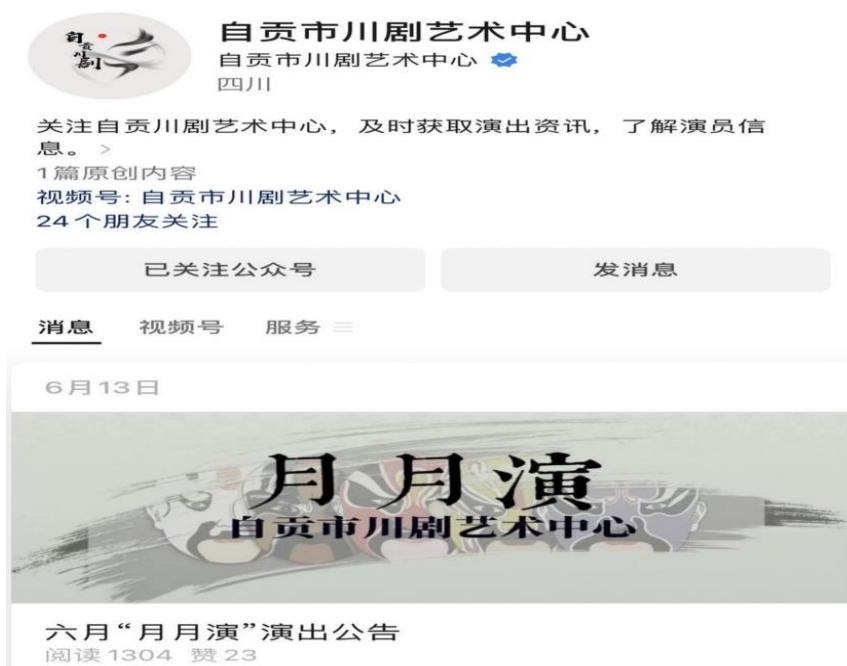
Figure 4 Zigong City Sichuan Opera Art Center WeChat official account

To improve communication and online visibility, the internet should be used as a medium for promoting Ziyang River Sichuan Opera. This can be achieved through smartphones and apps, allowing the opera to be known nationwide and even worldwide. Additionally, integrating performances with primary and secondary school art education and second grade and student clubs can help junior and middle school students experience the charm of Sichuan Opera up close.